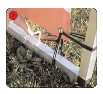
Ensure the ground peg covers the horizontal tube