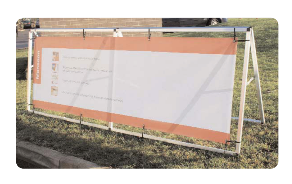
Ground peg fixing

Corner eyelets require a bungee cord loop around the top and the side of the frame to secure