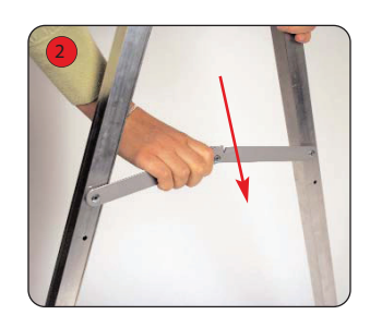
Push each locking arm down to secure the frame