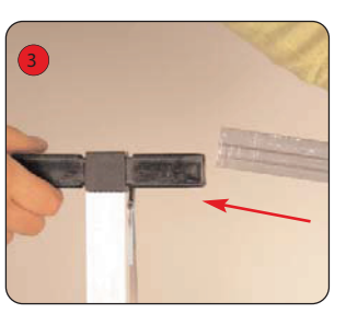
Push fit the top horizontal tubes into the 'A' frames, ensure the plastic joiners face inwards