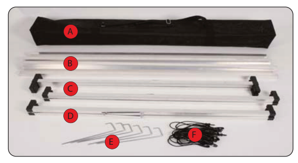
Kit Includes: Carry bag (A) Horizontal tube x8 (B) Centre 'A' frame x1 (C) End 'A' frame x 2 (D) Ground peg x6 (E) and Elastic bungee cord x24 (F)

Unfold your fabric fitted graphic and drape over your staked down Baseline a-frame.