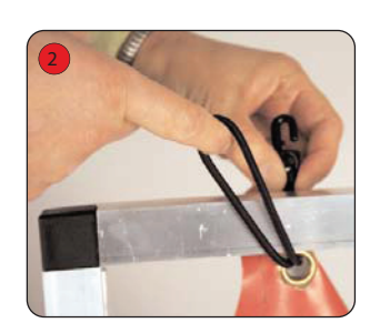
Pass the elastic bungee cord through the graphic eyelet and around the frame to secure

Corner eyelets require a bungee cord loop around the top and the side of the frame to secure