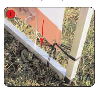
To secure the frame to grassed areas, push or hammer the ground peg into the ground