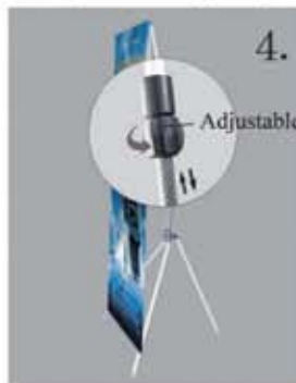
4. Installation completed.