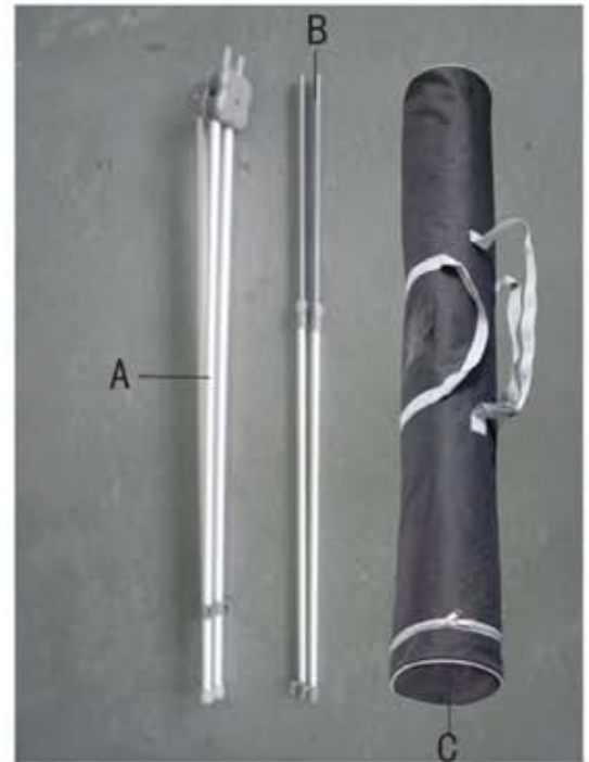
A. Supporting Feet B. Fiber Glass Poles C. Nylon Carrying Bag