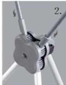
2. Insert poles in to supporting feet.