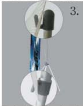
3. Attach the graphic to the poles.