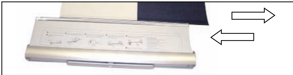
The strip on the bottom of the graphic, slides off the strip attached to the leader. The replacement graphic slides on easily.

Carefully secure the top of the newly attached graphic - preferably have someone hold it tightly - so you can remove the locking pin from the side and slowly feed the new graphic into the base.