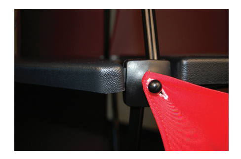
5.Place all CONNEX shelves into place to complete your Xpressions kit.

4. Start with one side of the shelf. Place the front corner of the shelf on the appropriate clip then lower the back corner into its clip. Lower the other side of the shelf into place onto its clips. Repeat for the rest of the connex shelves.