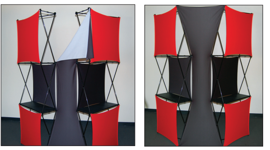
2. Attach the connecting skins to the Xpressions units.