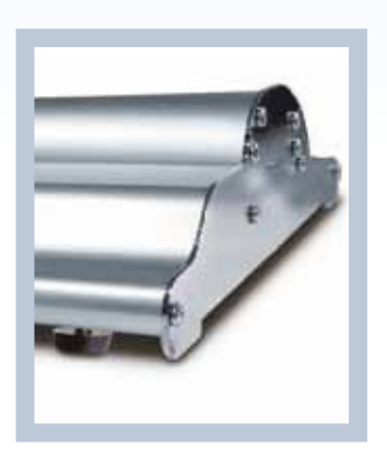
A stable design with feet that compensate for uneven surfaces.