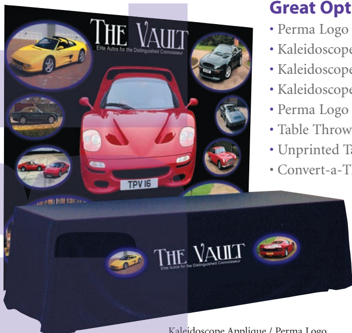
Kaleidoscope Applique / Perma Logo