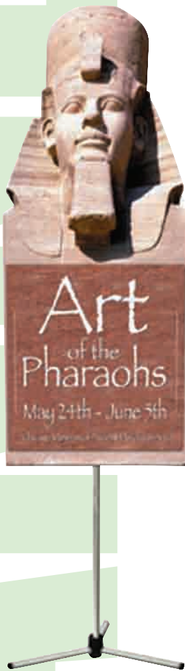
Summit with Rigid Substrate & Profiled Graphic

The Summit is a portable banner stand with a three-piece telescoping pole and spin-lock mechanism which allows for an adjustable mast and panel height up to 96". Just open the carrying case, put the unit on the floor, attach the graphic and adjust the height. Simply twist the spin-lock mechanism and slide the base collar up and down. No tools needed. 50w halogen spotlight and literature holders are available. All units are available in silver and black. The Summit can be a single or double-sided unit. Rigid Substrates with profiled graphics can be used on the Summit.