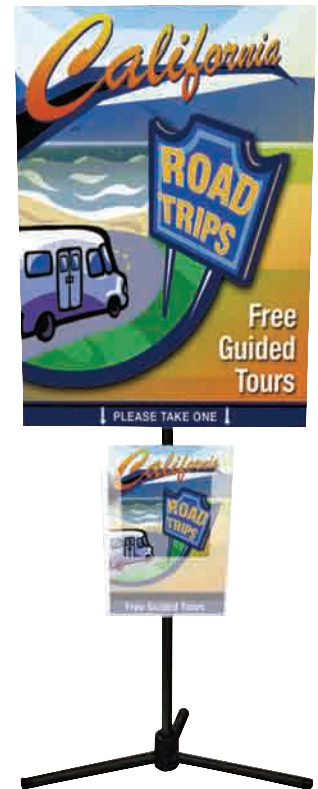
Summit with Combination Graphic and Literature Holder